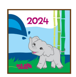
Super Seller Mags Patch sell 5+ mags