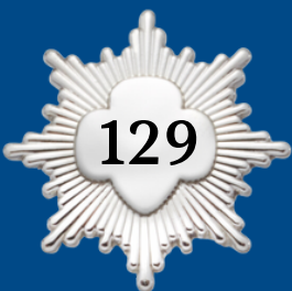
GIRL SCOUTS EARNED THEIR SILVER AWARD