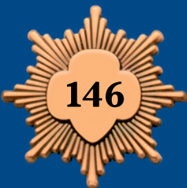
GIRL SCOUTS EARNED THEIR BRONZE AWARD