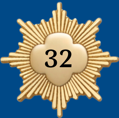
GIRL SCOUTS EARNED THEIR GOLD AWARD